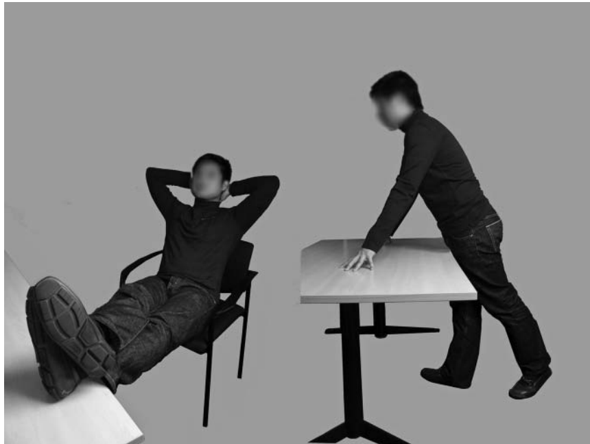
Fig. 1. The two high-power poses used in the study. Participants in the high-power-pose condition were posed in expansive positions with open limbs.