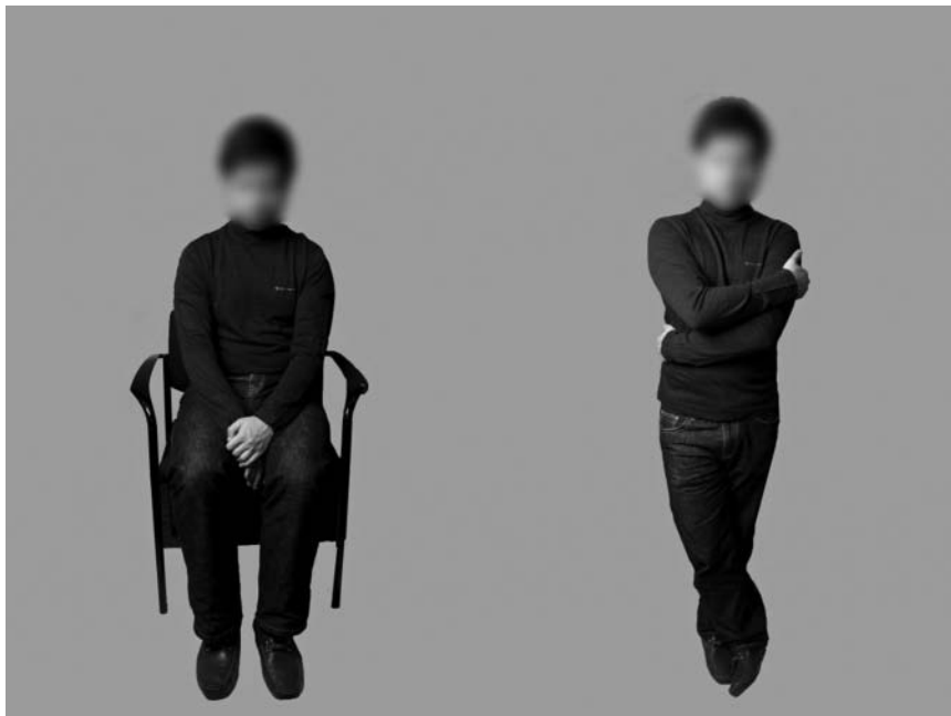
Fig. 2. The two low-power poses used in the study. Participants in the low-power-pose condition were posed in contractive positions with closed limbs.

To configure the test participants into the poses, the experimenter placed an electrocardiography lead on the back of each participant's calf and underbelly of the left arm and explained, "To test accuracy of physiological responses as a function of